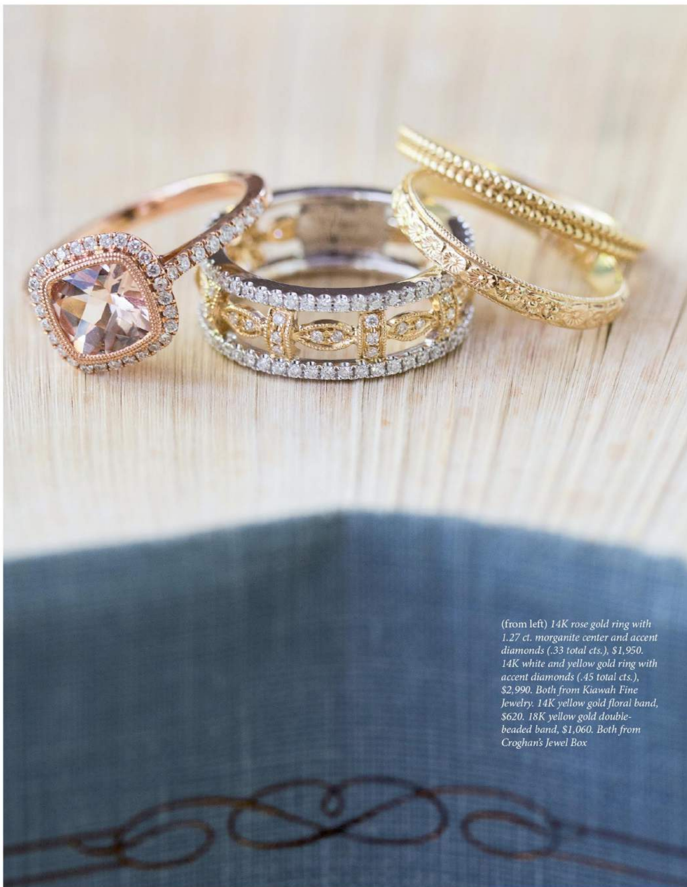
(from left) 14K rose gold ring with 1.27 ct. morganite center and accent diamonds (.33 total cts.), $1,950. 14K white and yellow gold ring with accent diamonds (.45 total cts.), $2,990. Both from Kiawah Fine Jewelry. 14K yellow gold floral band, $620. 18K yellow gold double-beaded band, $1,060. Both from Croghan's Jewel Box