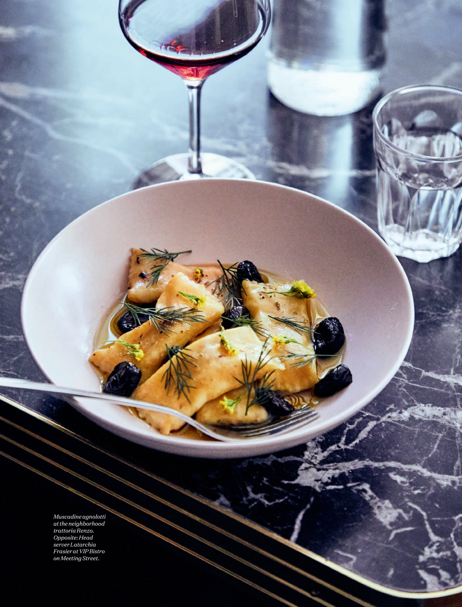
Muscadine agnolotti at the neighborhood trattoria Renzo. Opposite: Head server Latarchia Frasier at VIP Bistro on Meeting Street.