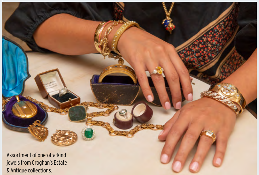
Assortment of one-of-a-kind jewels from Croghan's Estate & Antique collections.

Absolutely. Many customers who think they want a new item often find themselves purchasing an estate piece that fits their budget and taste a bit better. And vice versa: The bride who comes in wanting a vintage ring is sometimes won over by the perfections of a modern brilliant-cut diamond that an old mine cut does not offer. It is optimal to have both choices under one roof. Our customers often move seamlessly from one to the other when considering a purchase. ■