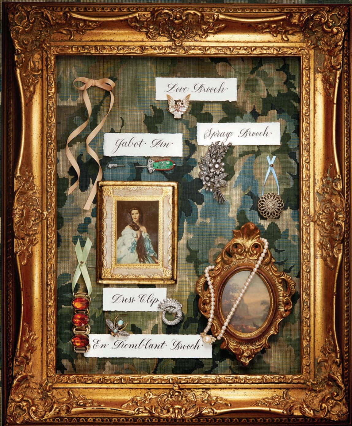
LOVE BROOCH: Antique Sweetheart pin, $225; lazydogantiques.rubylane.com. • SPRAY BROOCH: Victorian Diamond Floral spray brooch, $11,750; langantiques.com. • JABOT PIN: Cartier Art Deco Jade jabot pin, $44,500; msrau.com. • DRESS CLIP: LaCloche Frères Art Deco diamond dress clip, $18,500; simonteakle.com. • EN TREMBLANT BROOCH: Victorian En Tremblant fly pin, $1,000; croghansjewelbox.com. • BACKGROUND FABRIC: Hampstead Verdure, $440 per meter; watts1874.co.uk.

Having evolved from the humbly utilitarian to the exuberantly decorative, fanciful brooches are enjoying an arresting fashion renaissance. Here, a look at the radiant breastpins, both past and present