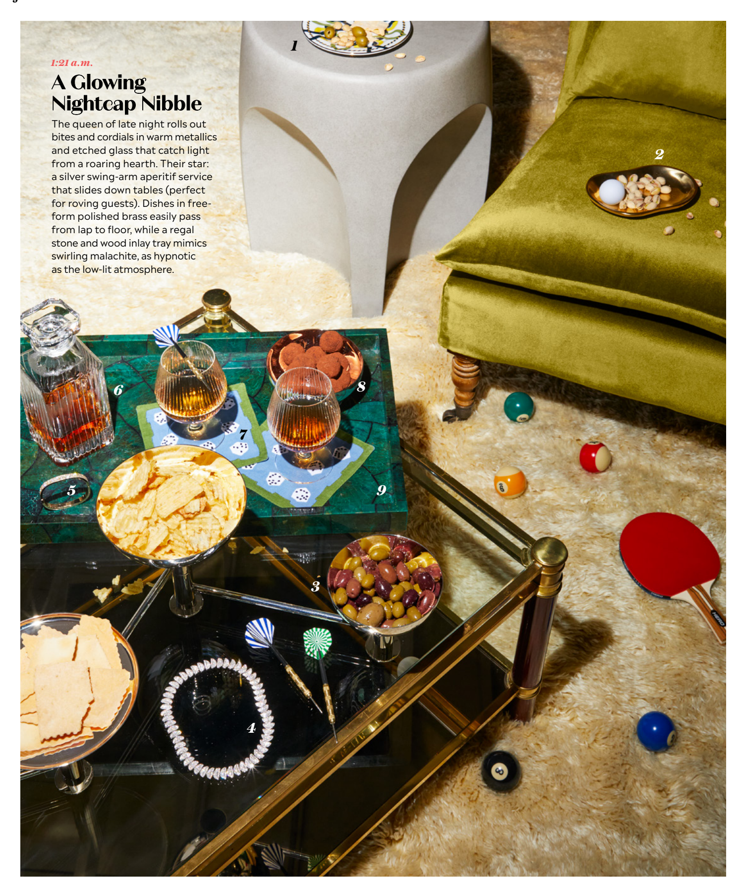
ABOVE: 1. La Double J Costiera dessert plate, Design Supply. 2. Young Huh Victoria Polished dish, Modern Matter. 3. Silver aperitif service, Houses & Parties. 4. Eclisse Endless necklace, Vhernier. 5. Alex Cobblestone bracelet, Single Stone. 6. Natalia Whiskey decanter and snifters, Vietri. 7. Dice cocktail napkins, Elizabeth Lake. 8. Babylone small bowl, Christofle. 9. Sapian Bay tray, Wildwood. For other buying information, see The Sourcebook, page 134.