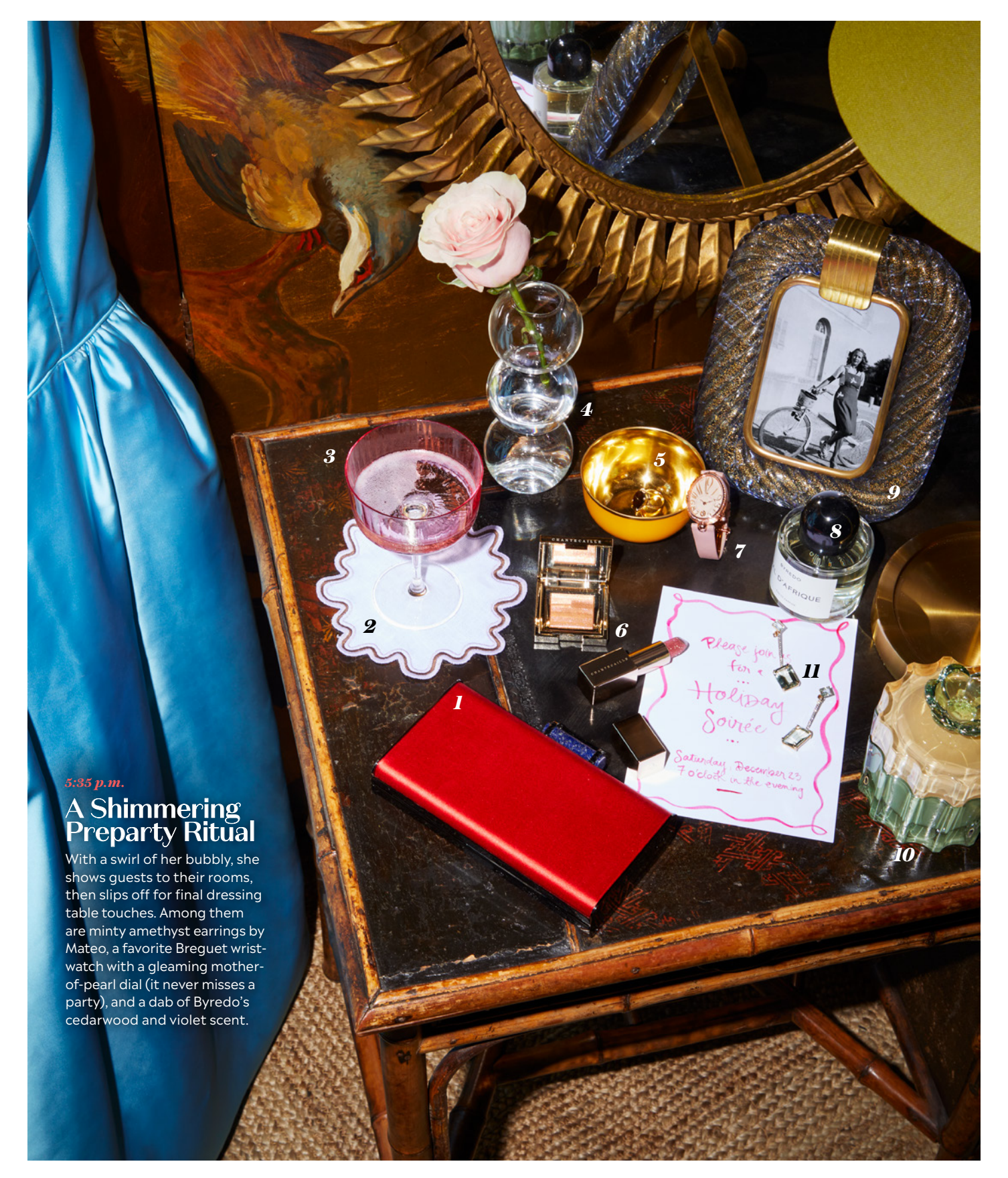
PAGE 28, CLOCKWISE FROM LEFT: Scallopino bedding, Schweitzer Linen. • Clawfoot Opaline glass box, Loren Hope. • Jardin cache-pot, CeCe Barfield. • Velvet Venetian mules, Le Monde Béryl. • Velvet quilt, Biscuit Home. • Luggage stand, Sibyl Colefax & John Fowler. • Paravel Main Line duffle, The Travel Studio. ABOVE: 1. Scala Insignia clutch, CH Carolina Herrera. 2. Wave cocktail napkin, Matouk. 3. Gems cocktail glass, LSA International. 4. Bubble vase, March. 5. Augarten Champagne cup, Eleish Van Breems. 6. Radiant Gold eye shimmer and Lip Cristal, Chantecaille. 7. Reine de Naples 8918 watch, Breguet. 8. Bal d'Afrique perfume, Byredo. 9. Venini Murano frame, Found by Maja. 10. Creart Doge glass box, Artemest. 11. Mint Green earrings, Mateo. For other buying information, see The Sourcebook, page 134.