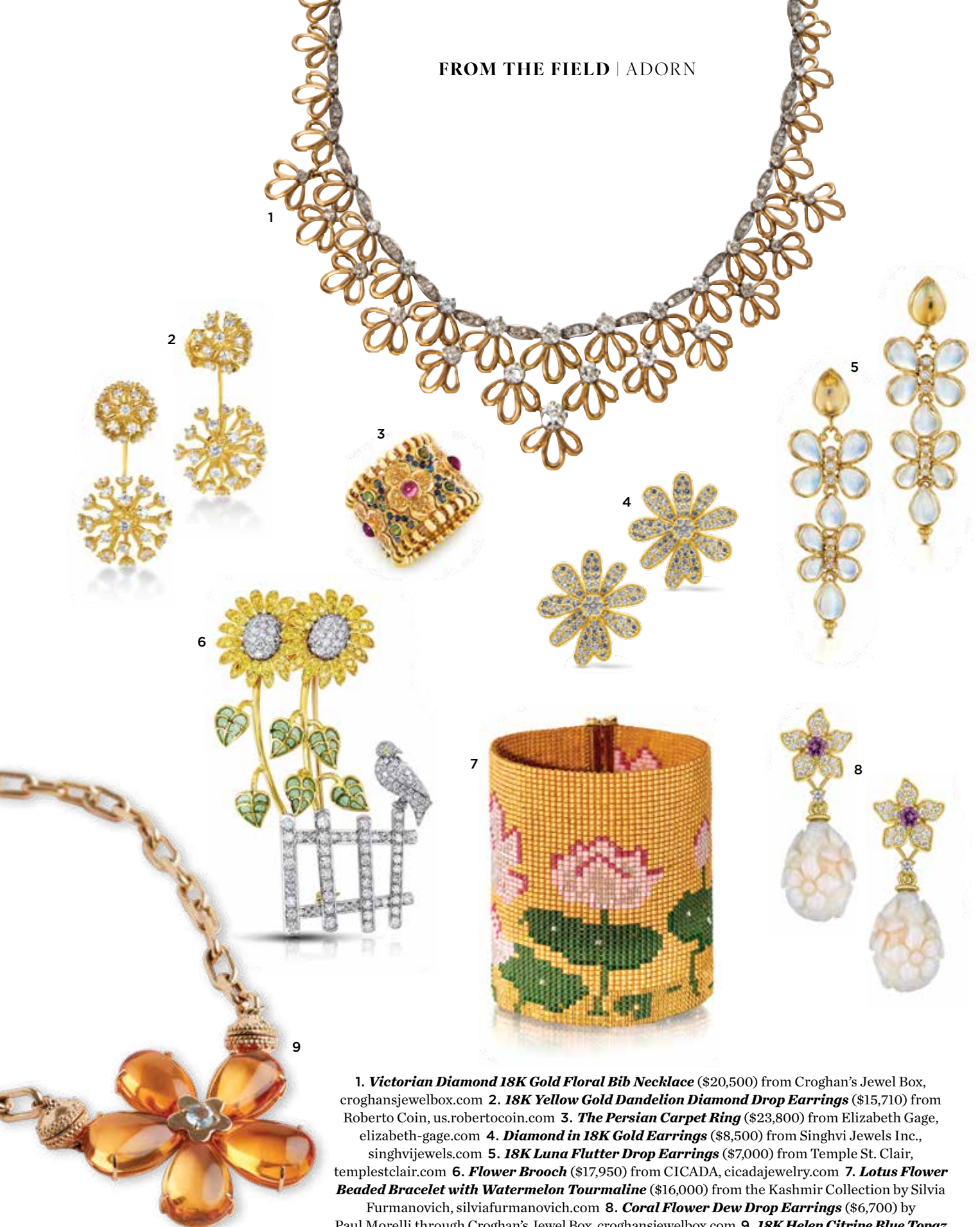
1. Victorian Diamond 18K Gold Floral Bib Necklace ($20,500) from Croghan's Jewel Box, croghansjewelbox.com 2. 18K Yellow Gold Dandelion Diamond Drop Earrings ($15,710) from Roberto Coin, us.robertocoin.com 3. The Persian Carpet Ring ($23,800) from Elizabeth Gage, elizabeth-gage.com 4. Diamond in 18K Gold Earrings ($8,500) from Singhvi Jewels Inc., singhvijewels.com 5. 18K Luna Flutter Drop Earrings ($7,000) from Temple St. Clair, templestclair.com 6. Flower Brooch ($17,950) from CICADA, cicadajewelry.com 7. Lotus Flower Beaded Bracelet with Watermelon Tourmaline ($16,000) from the Kashmir Collection by Silvia Furmanovich, silviafurmanovich.com 8. Coral Flower Dew Drop Earrings ($6,700) by Paul Morelli through Croghan's Jewel Box, croghansjewelbox.com 9. 18K Helen Citrine Blue Topaz Flower Centerpiece ($6,995) on Ogden Necklace ($1,995) from Clara Williams, clarawilliams.com