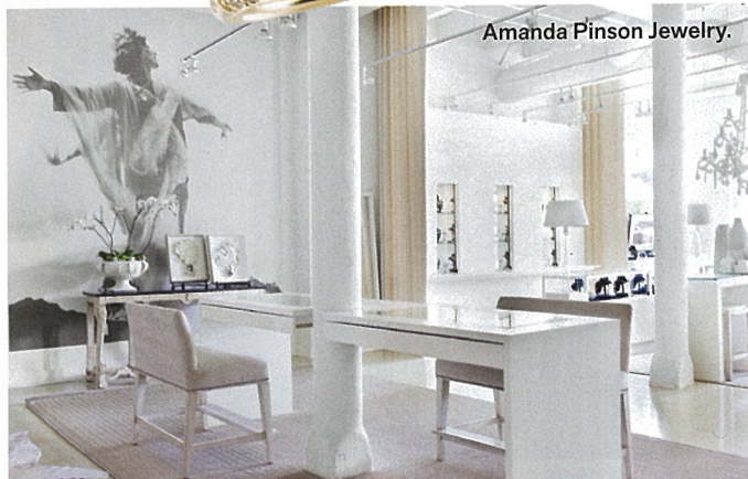
Amanda Pinson Jewelry.

Sanchez, Pomellato ( below left ). 1110 Market St.; amandapinsonjewelry.com .